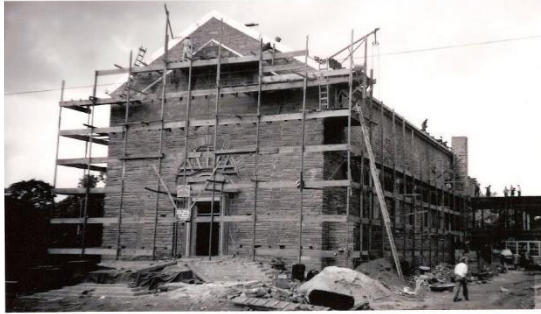
The Presbyterian Church of Chestnut Hill, 8855 Germantown Avenue, showing stonework added to the structure. The building's stonework by Lorenzon Brothers used stone from the excavation of the basement.